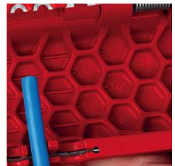
90 22 02 SB: Injection moulded length scale for consistent stripping to a uniform length, legible for left and right handed users