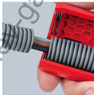
Clean cutting edge with no damage to internal cables as the cut is always at the top of the corrugation