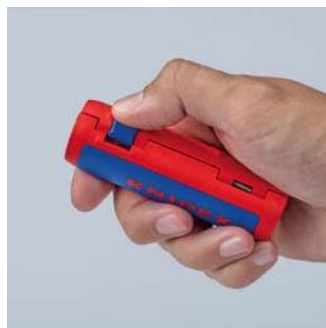
Convenient handling due to fastener with locking device and opening by means of internal spring