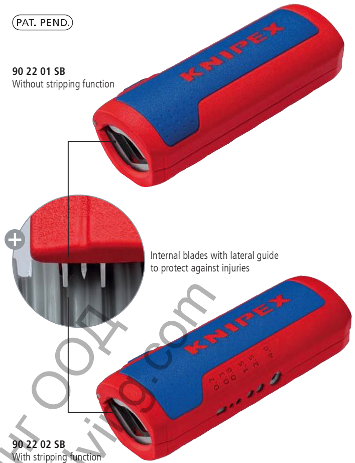
90 22 01 SB Without stripping function

Internal blades with lateral guide to protect against injuries