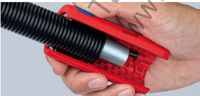
Also for protective pipes on aluminium composite pipes in plumbing, up to a diameter of 32 mm